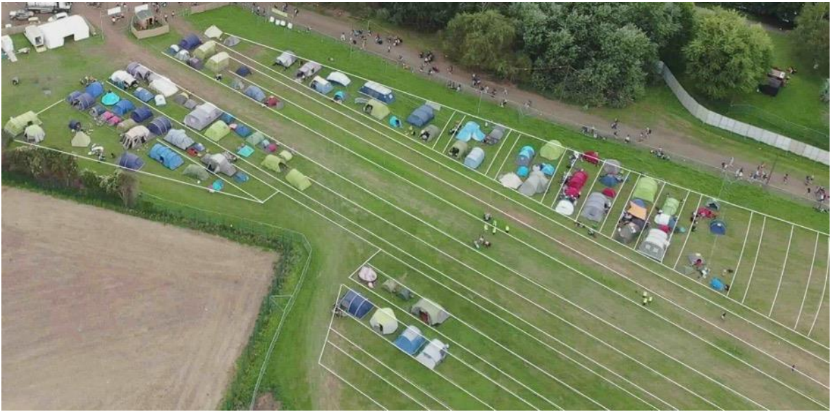
The image shows a field with tents in lines from a Live Nation Festival in 2023.

Following a successful launch in 2023, the accessibility campsite is marked out in lines providing 4x4 metres of space per tent. Tents must be pitched in parallel rows within a pre-allocated pitch size, kept in line by marked lanes that keep the fire lane and path to your tent clear to ensure you can move freely around the campsite. The campsite staff will guide you to the next available space on arrival.