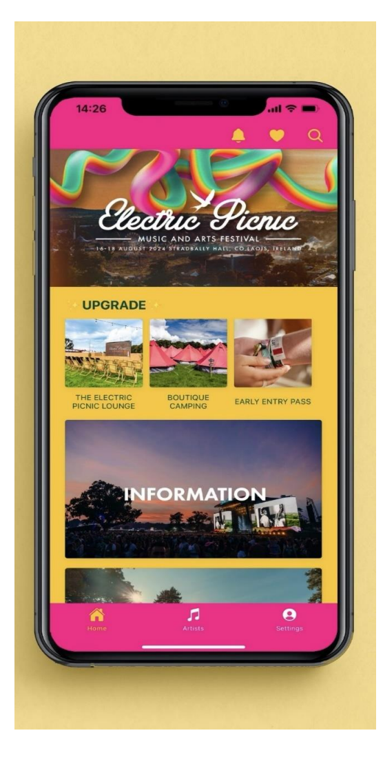
Image shows the home screen of the Electric Picnic Festival mobile app.

Please download the festival app to your mobile phone by visiting the Apple Store or Google Play and searching for Electric Picnic Festival.